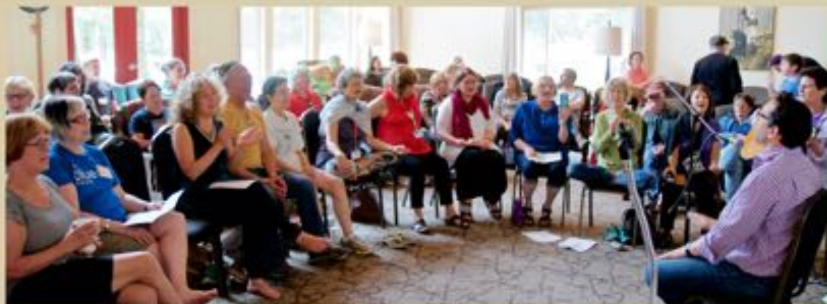
En Shalom Retreat