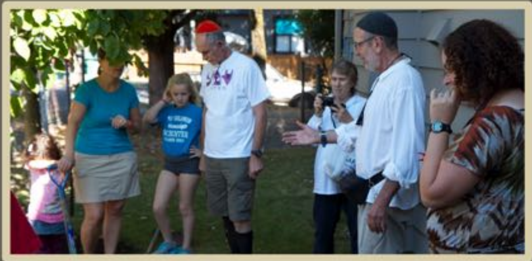
High Holidays Family Program