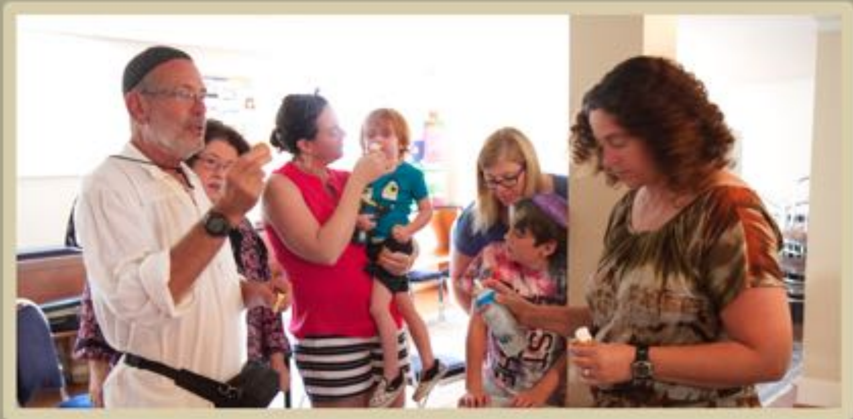
High Holydays Family Program