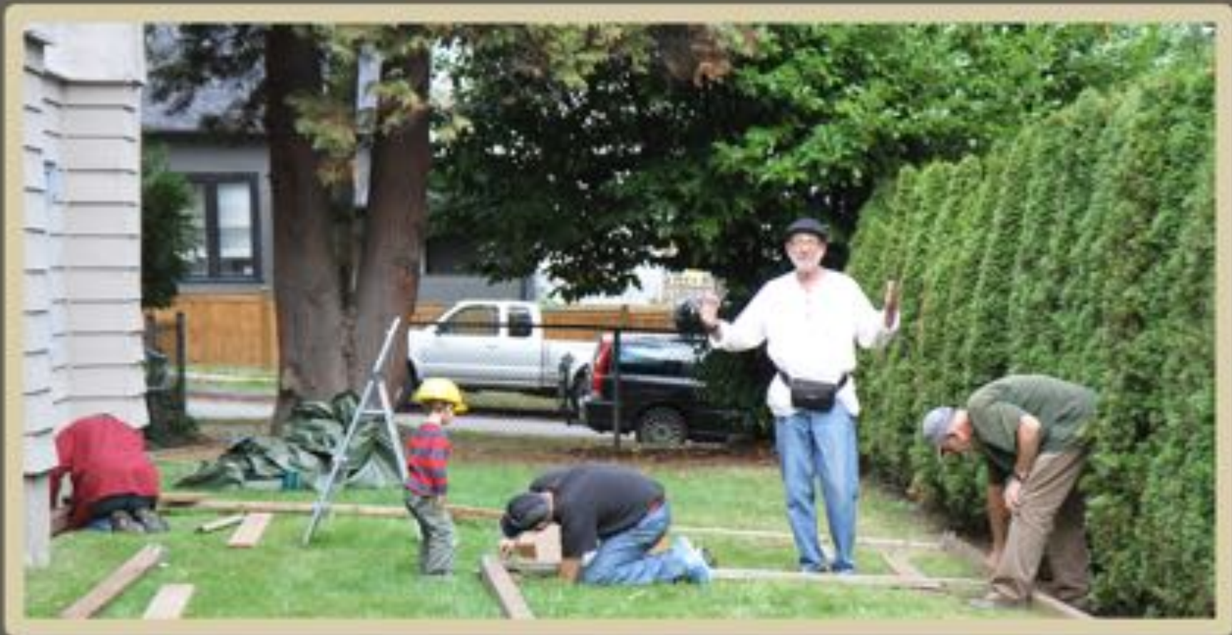
Building the Sidewalk