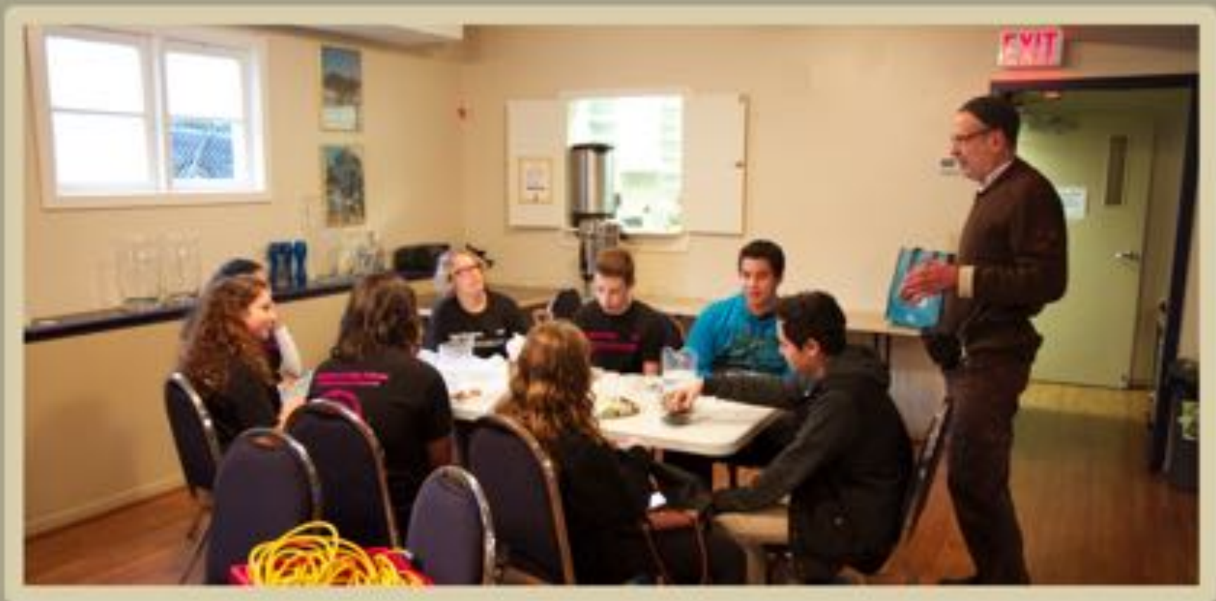
With Students from King David High School