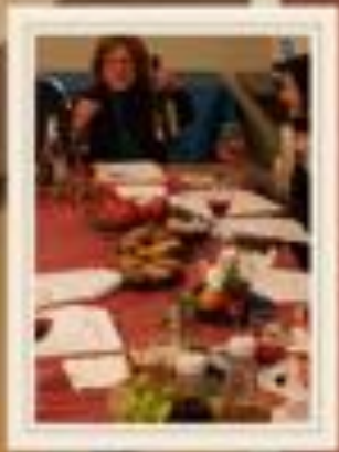
To B' Shant Sahn