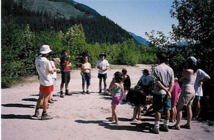
A recent Adam va-Adamah retreat